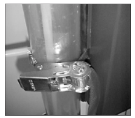
Ratchet tie-down belt

(approximately 5 feet) above the jaws to allow the tubing to reach the tubing discharge clamp, and then tighten the clamp until the jaws are completely closed. The tubing clamp is designed to accept I" OD, 5/8" OD and I/2" OD polyethylene or Teflon tubing. Now position the tubing such that it will not chafe on the well casing and lock the clamp arm in place by inserting the clevis pin through the fork and the mating hole in the clamp arm.